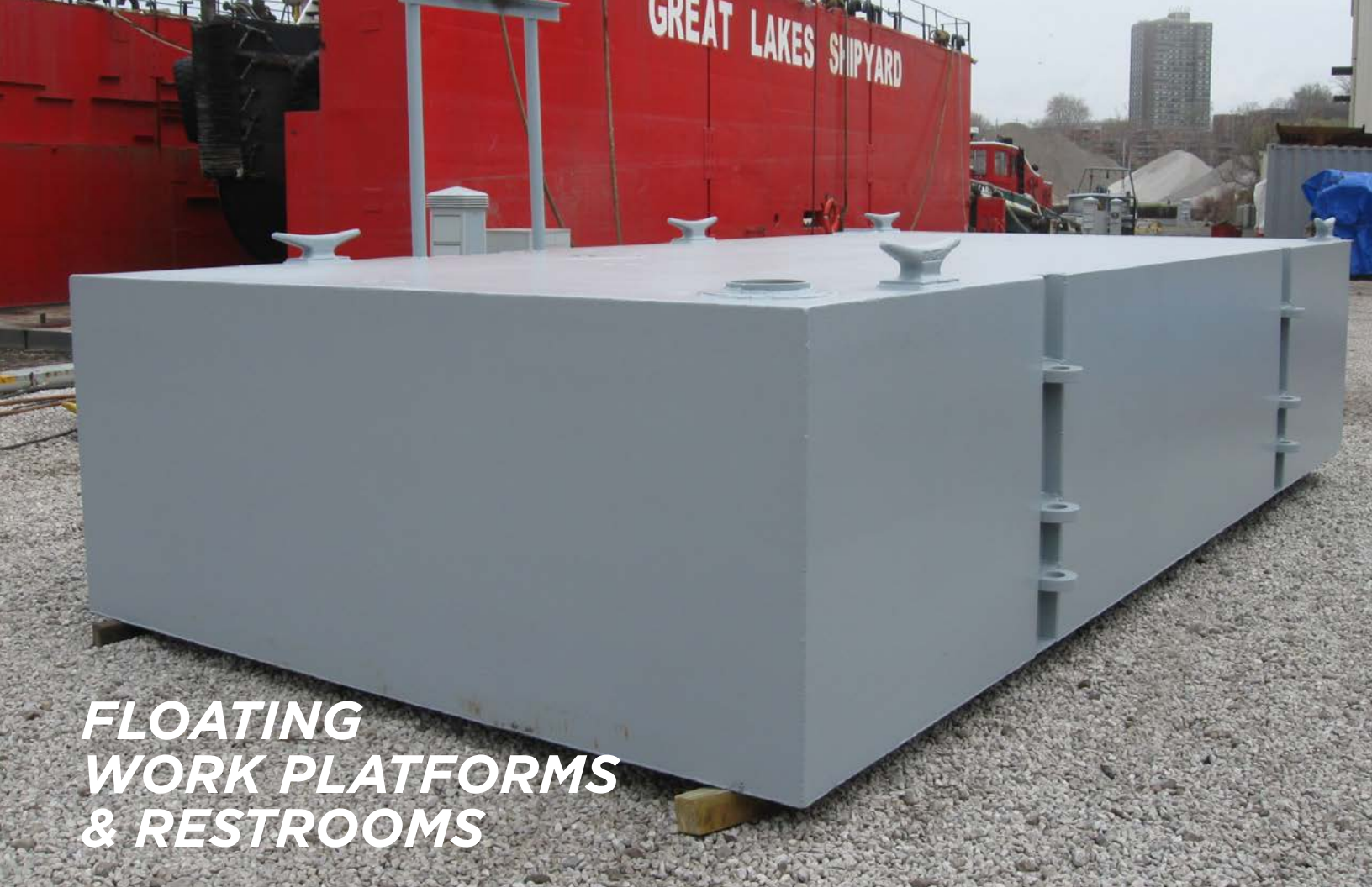
FLOATING WORK PLATFORMS & RESTROOMS